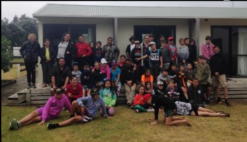
Room 3 and 4 Camp at Pakiri last week. Heaps of learning and fun had with snorkelling at Goat Island and adventures in Auckland