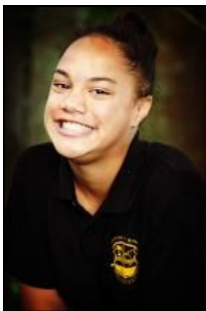
Sportsperson Excellence In Arts Waimitikia Perene