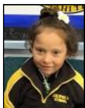
Room 2 Summah Pene